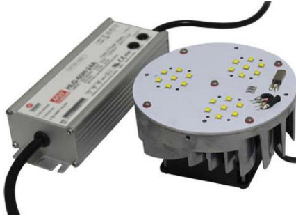
35W - 45W - 60W